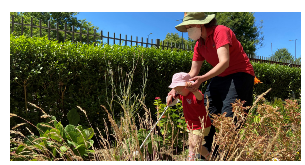
Annual sponsored obstacle course in Playskill groups