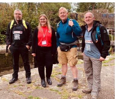
Our dedicated runners, walkers & trekkers