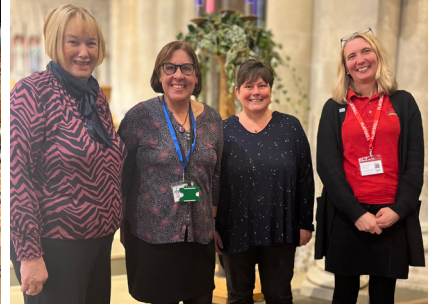
Christmas choirs, carol concert, gift wrapping and festive fun

66 Our fundraising plays a small part in helping Playskill continue to help families the way that they helped ours.