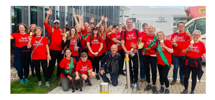
Team Playskill at the Great Big Walk for Herts